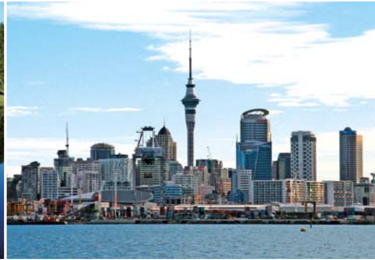
FRESH AIR ABOVE Air quality is good in New Zealand; Auckland BELOW Auckland's air is cleaner than New York and Shanghai