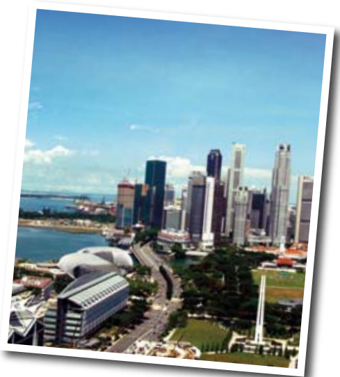
MAKING HISTORY CLOCKWISE FROM TOP LEFT Heritage Christchurch; Heritage Auckland; IEQ Global aims to improve air quality in Singapore

With stewards like these at the helm, our indoor and outdoor environment is in good hands. ■